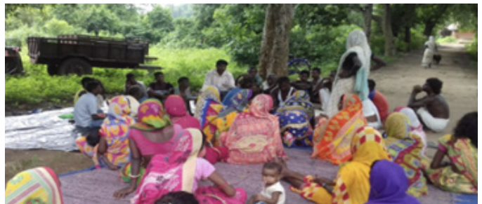
Gathering of locals and union workers to inspire them for the campaign against famine

Primitive Tribes Convention: In the memory of Tribal leader Uma Shankar Baiga, JMKU conducted a gathering for awareness of tribal rights. Focus was on teaching people to be united against injustice and educating children about their culture heritage and awareness about the ongoing schemes and constitutional rights. This convention had a strong participation of more than 400 women and men. It was decided to hold an agitation to seek Government's attention to run the ration, pension and housing scheme in a sustainable manner and to continue until the claim of land rights is achieved.