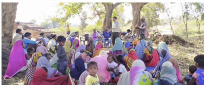
Meetings with the Panchayat to bring awareness related to famine and potential counter-measures

Campaign to fight Famine: Every 3 to 4 years the Palamu region is affected by famine. It is a rain shadow region and as the land is uneven there is very less retention of water. There are no assertive actions being taken to combat this situation. Every time an attempt was made to bring systematic changes, the union was confronted with corruption practices and not much progress could be made. The Gramsabha is not familiar with these. Keeping these things in mind, the JMKU organized several sit-in meetings and workshops throughout the year with the help of regional activists to sensitize the Panchayat officials to the problems due to famine.