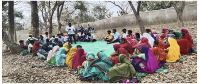
Gram Sabha Awareness Journey from grassroots level to National Level

Campaign to fight Famine: Every 3 to 4 years the Palamu region is affected by famine. It is a rain shadow region and as the land is uneven there is very less retention of water. There are no assertive actions being taken to combat this situation. Every time an attempt was made to bring systematic changes, the union was confronted with corruption practices and not much progress could be made. The Gramsabha is not familiar with these. Keeping these things in mind, the JMKU organized several sit-in meetings and workshops throughout the year with the help of regional activists to sensitize the Panchayat officials to the problems due to famine.