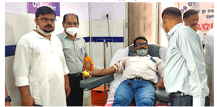
Setting an example by donating blood. Got 68 people to donate blood in two settings