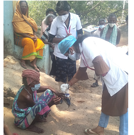
Taking medical workers to the community