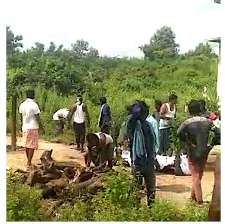
Providing help with cremation during the pandemic