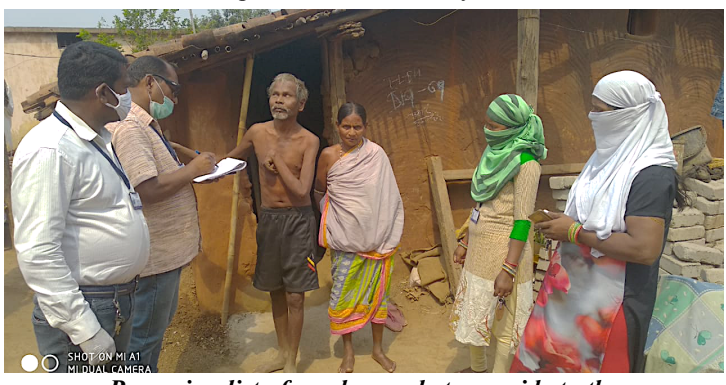
Preparing list of needy people to provide to the District Collector for appropriate action